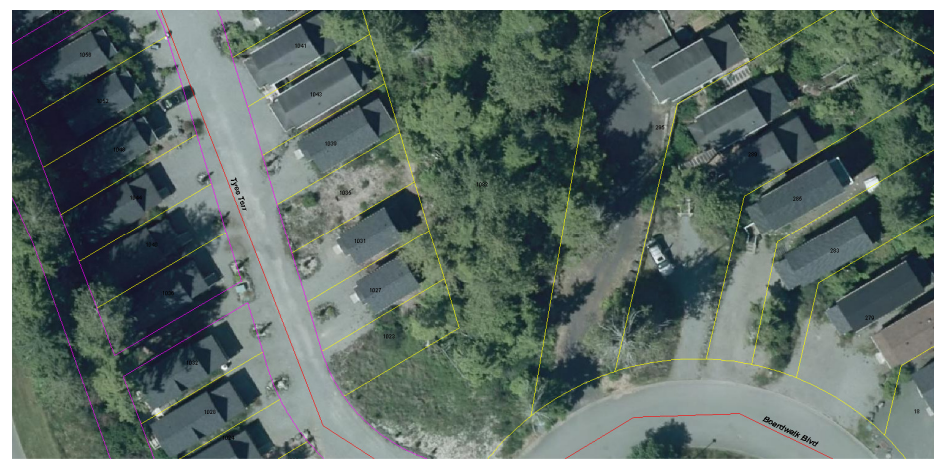
Figure 2 – Site context

Plan VIS6131—Lot 4 Plan VIS6132—Lot 2 Plan VIP66186—Lots 18, 20, and 22